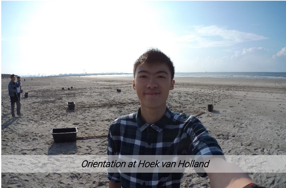
Orientation at Hoek van Holland

Class does not start until the second week of September, so I had more than enough time to adapt and plan my 4 months of exchange. Each year, the Erasmus University welcomes students back to school with a series of events, including a welcoming day for all students, an exchange student specific orientation (€80), celebration festival called "heart beat festival" held on campus and many more.