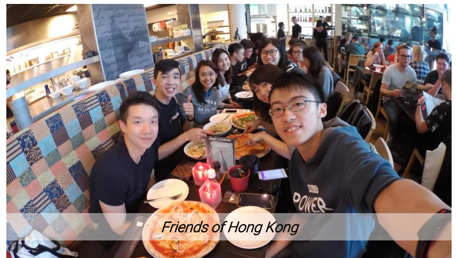
Friends of Hong Kong

Outside class, I met friends from Hong Kong who are also on their exchange in Rotterdam. There were 20 of them. We had our own welcoming dinner at a nice pizza place!